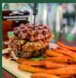
Chicken & Waffles